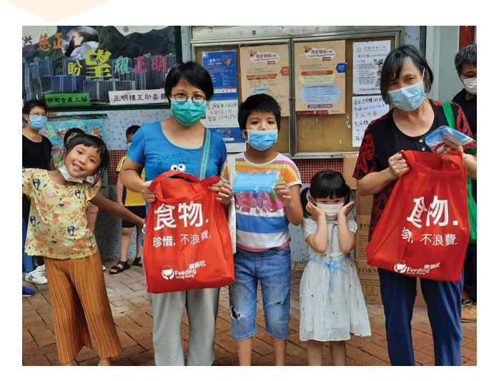
樂餉社收集、分類和轉贈食物,支援社會上的有需要人士。 Feeding Hong Kong collects surplus nutritious food, which is then sorted, inspected, logged and served to people in need.